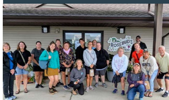
Attendees learn about production