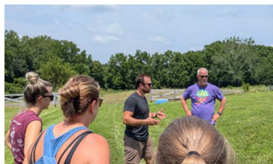
Educators learn about regenerative grazing