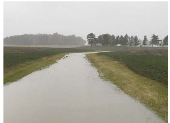
GRASSED WATERWAY AFTER HEAVY RAIN