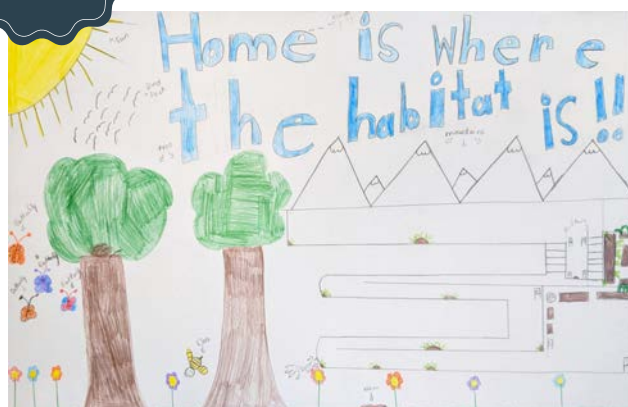
Audra Vehorn - Botkins 4th Grade